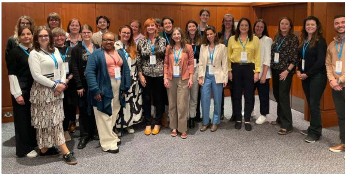
WEO Member Organisations represented at the WCE2023 during our Pre-Congress Session on May 3rd, 2023 in Edinburgh, UK